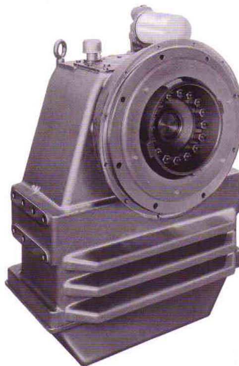
MG-5170DC shown with standard equipment.

The MG-5170DC Deep Ratio Transmission features the latest gear/clutch technology. The result is a high capacity, reverse-reduction transmission for the rugged service encountered by today's hard working diesel engines.